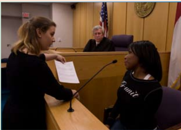
Student attorney cross-examines a witness.

This outstanding civic education program is guaranteed to improve your students' public speaking, writing, listening and critical thinking skills while enhancing their understanding of the U.S. legal system. Learn how the legal profession is offering to help prepare your students for North Carolina's only state-wide mock trial competition today. Visit us on the web at www.ncaj.com/page/public_info/ Click on "Mock Trial."