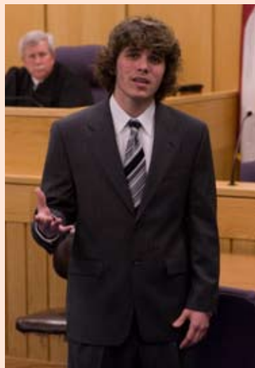
Students learn valuable critical thinking skills and gain confidence in public speaking.